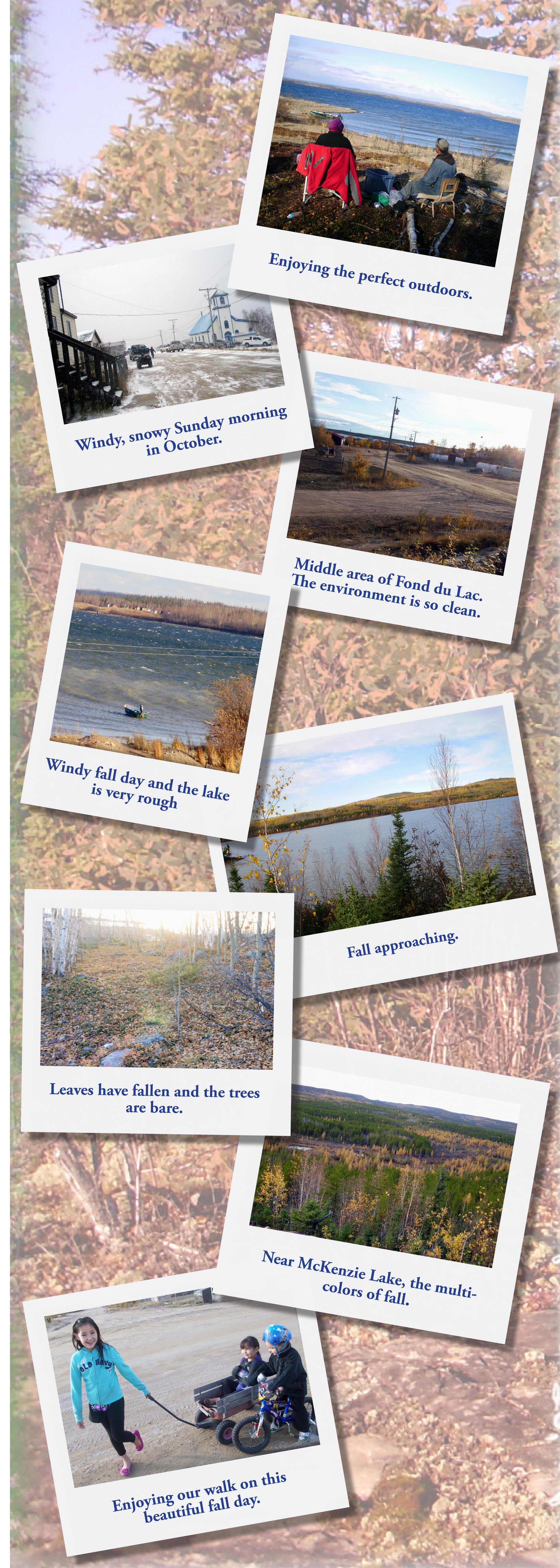
Enjoying the perfect outdoors.