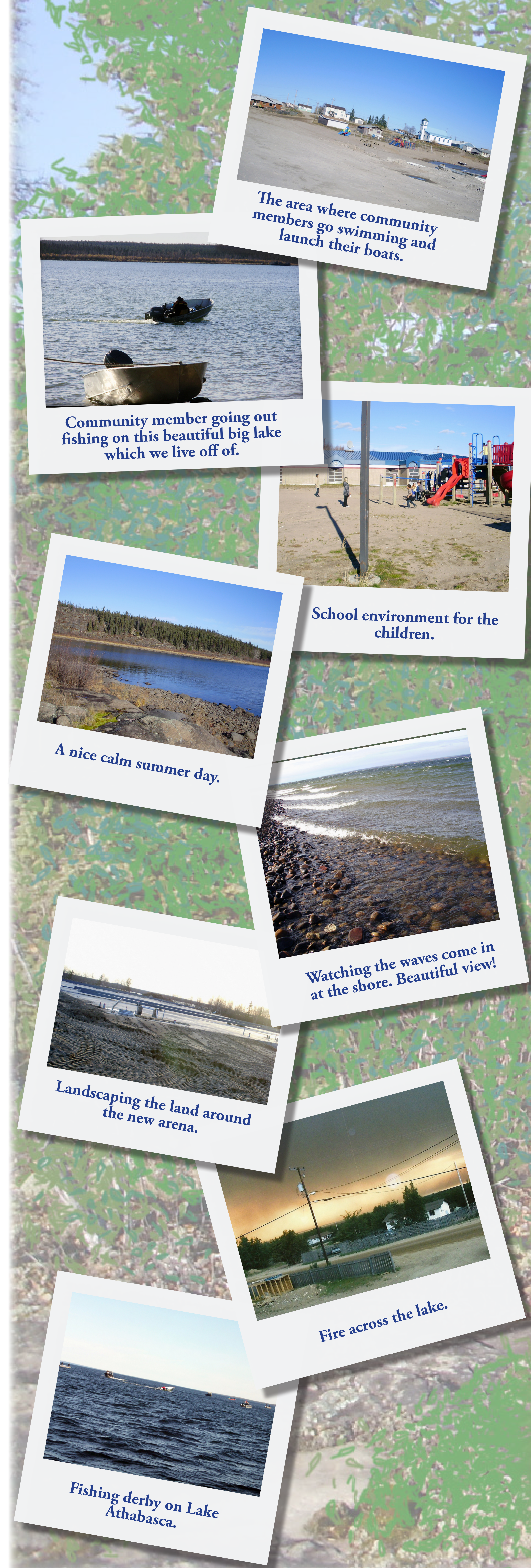
The area where community members go swimming and launch their boats.