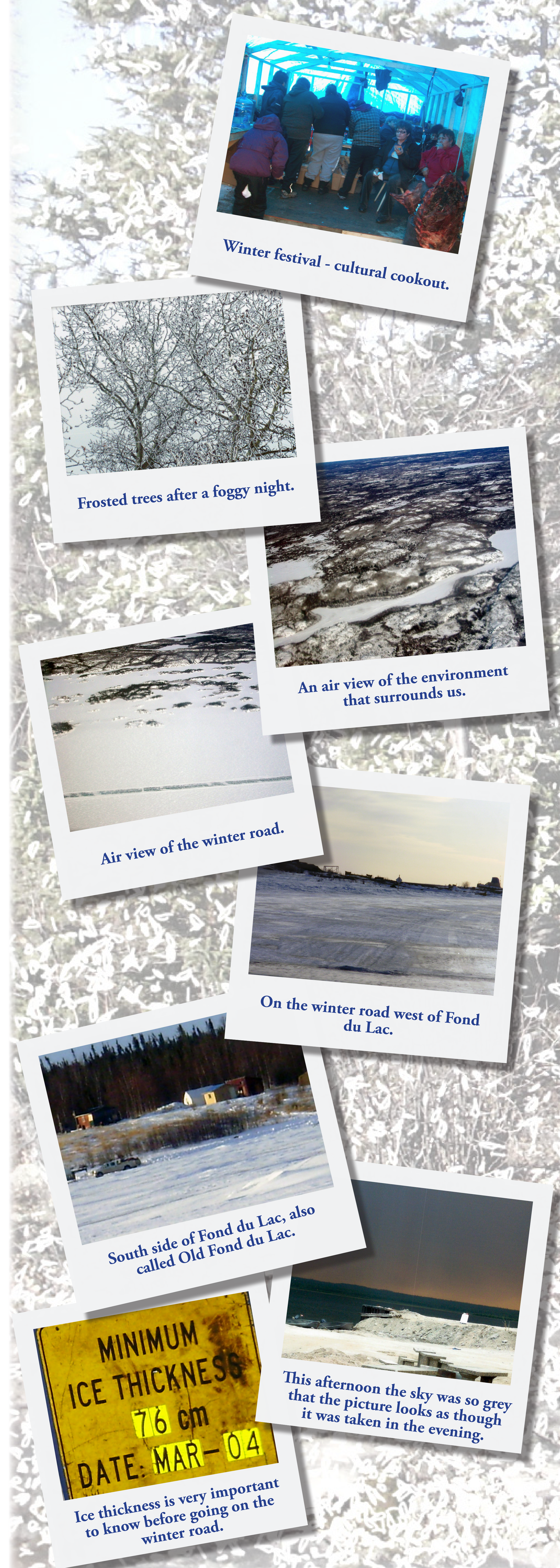
Winter festival - cultural cookout.