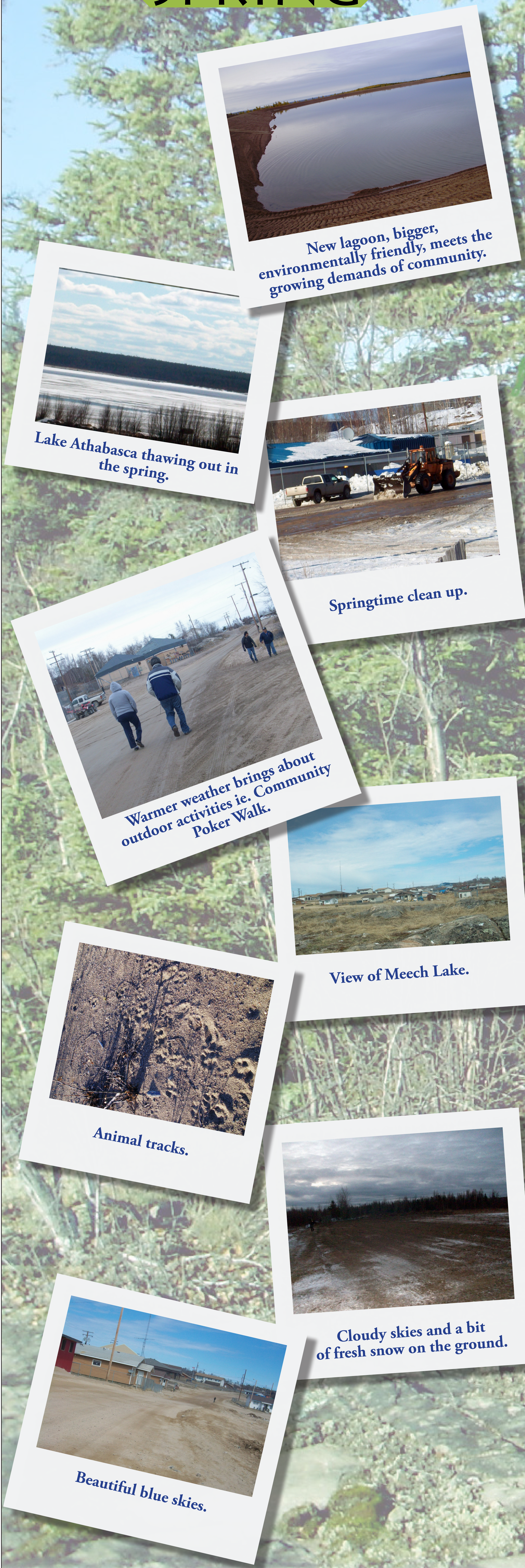
New lagoon, bigger, environmentally friendly, meets the growing demands of community.