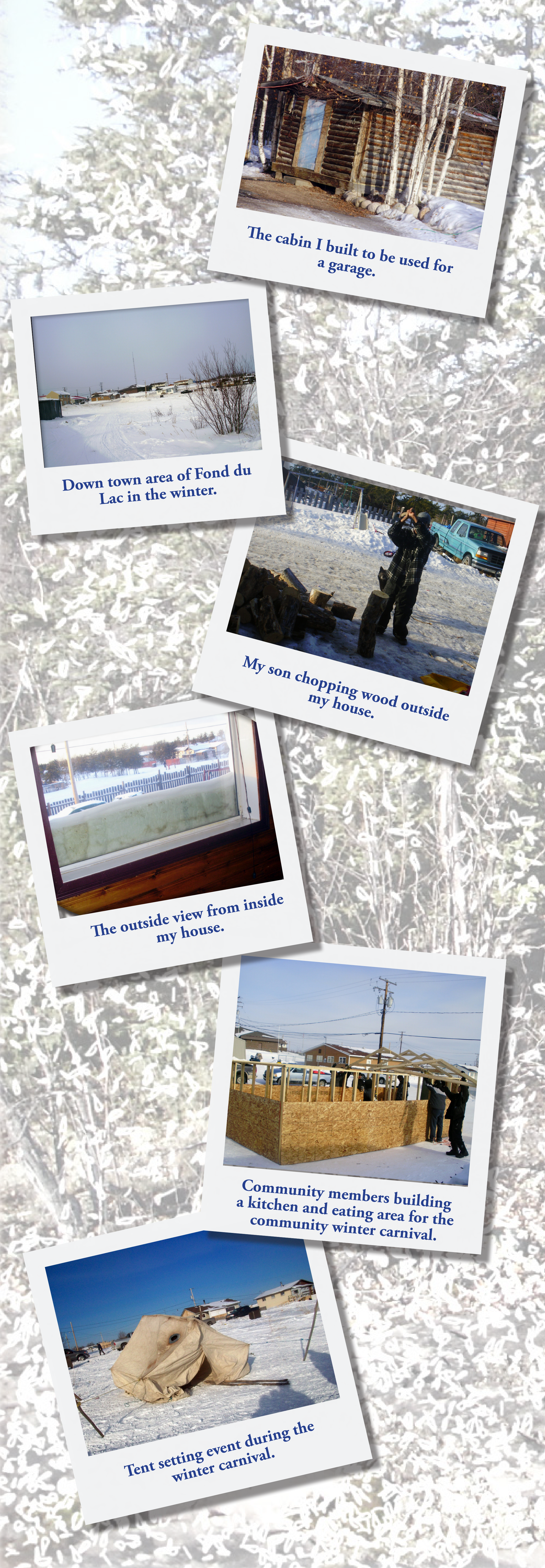
The cabin I built to be used for a garage.