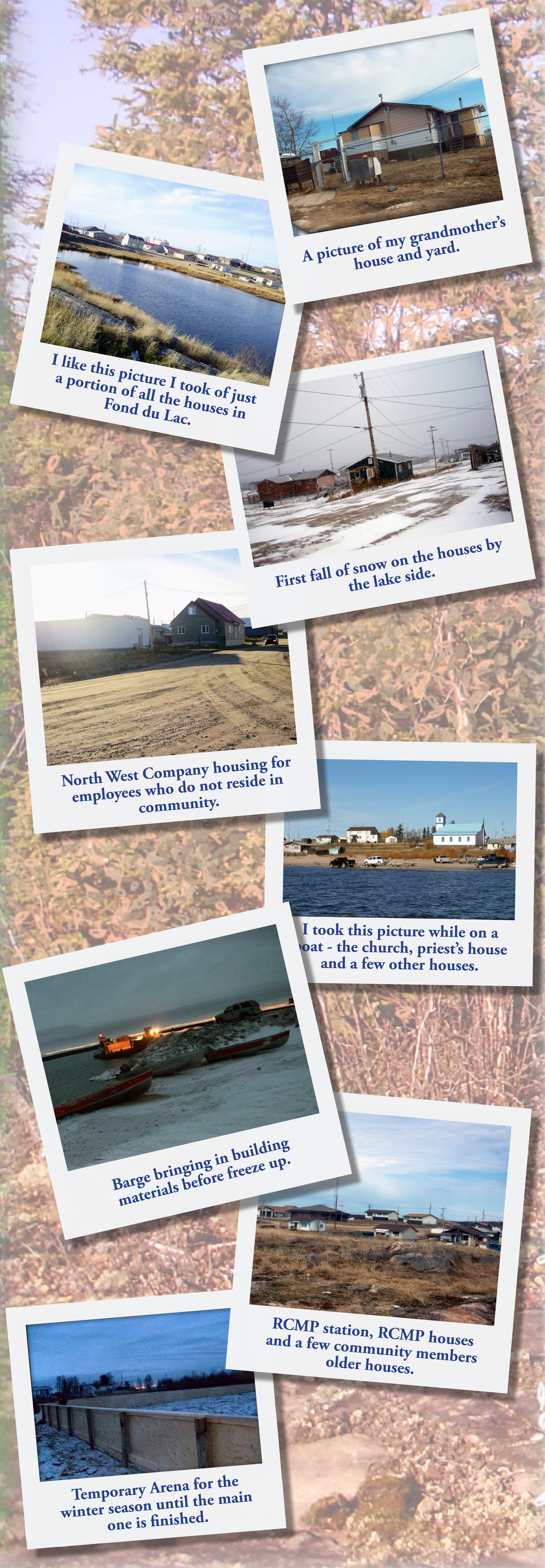
I like this picture I took of just a portion of all the houses in Fond du Lac.