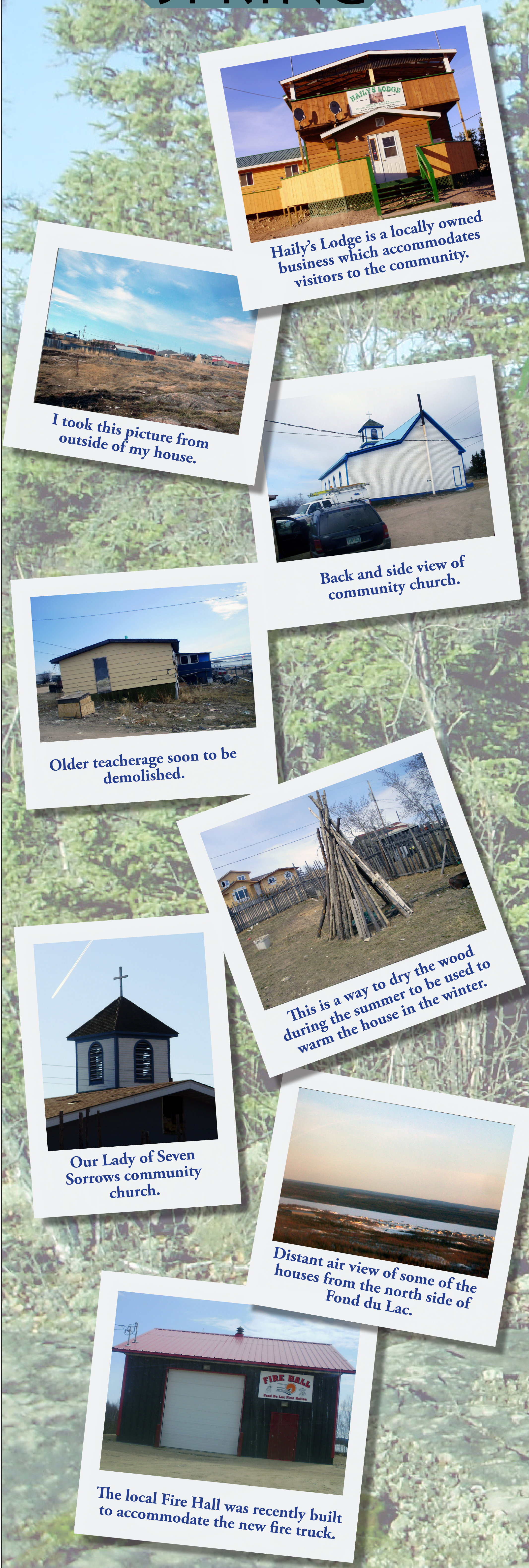
Haily's Lodge is a locally owned business which accommodates visitors to the community.